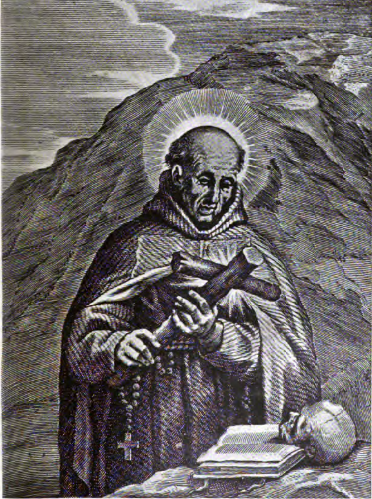
SAINT PETER OF ALCÁNTARA