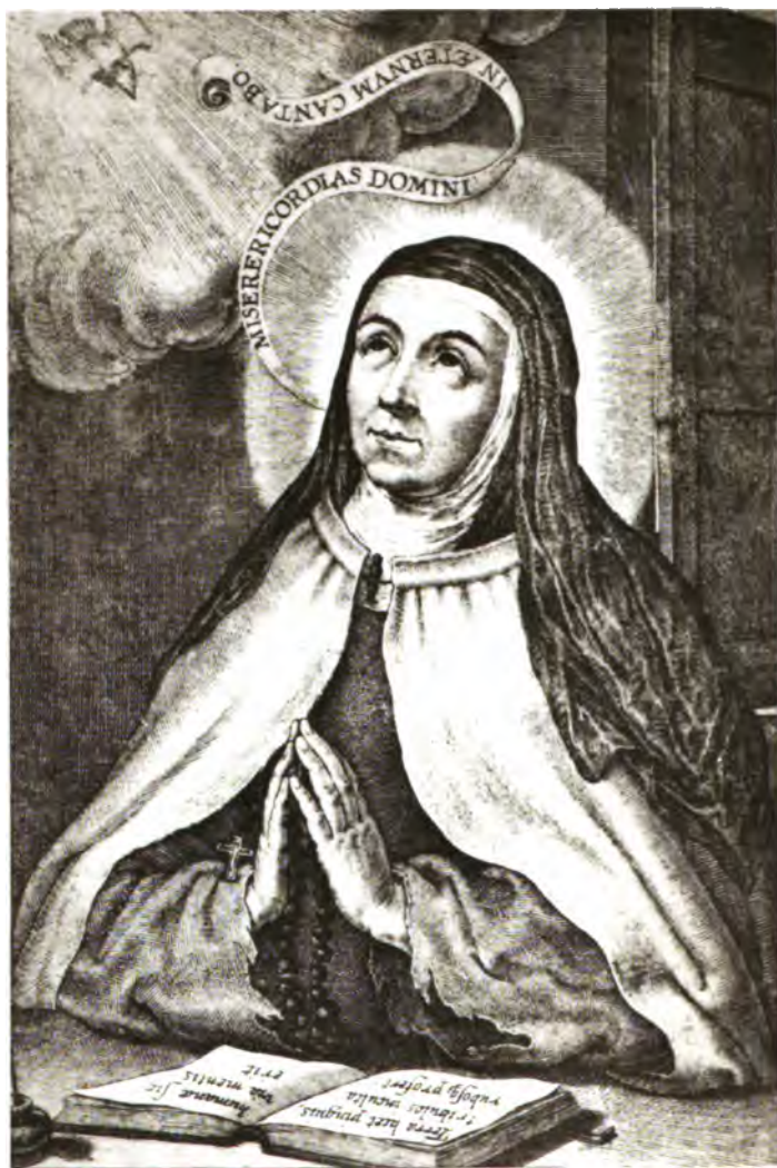
S. Teresa. (FROM AN OLD PRINT.)